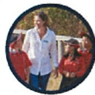
Build skills through fun